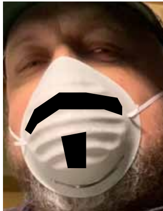
Cold Cracka Fool

You may have time on your hands these days, so it's time to vote for your favorite facemask in the 1st ANNUAL ROTARY FACEMASK SMACKDOWN!! Winner gets two weeks of quarantine with unlimited access to either Saved by the Bell or Mannix. Send your vote to moiph@comcast.net.